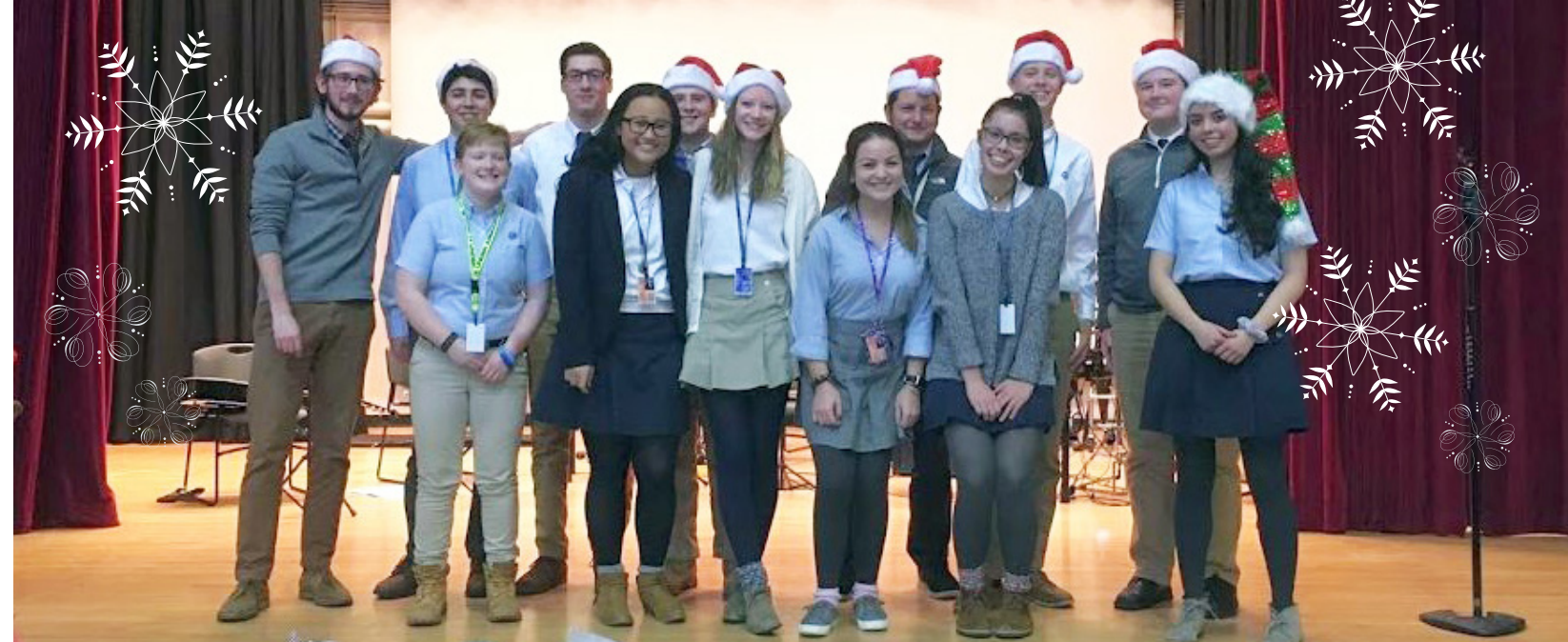
The Gilmour Academy Make A Difference Club and band members.

For our residents, being engaged and spending time with family and friends during the holidays, and any time of year, is truly time well spent. ♦